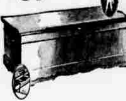
this glowing maple design at $59.50