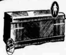
this style in walnut with marquetry inlay at $54.50