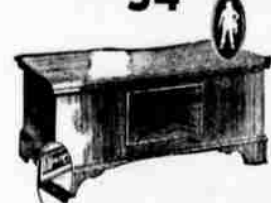
this handsome mahogany veneer at $52.50