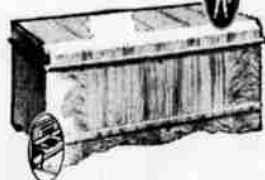
this Prima Vera veneer, set off by quilted maple, at $49.50

...and yet Cavalier is the most thoughtful and loving gift you could give... for it allows her to please herself! Come in now and ask about the Cavalier Miniature Gift Token. We furnish it without charge when you order a Christmas Cavalier.