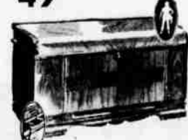
this beautiful walnut veneer style at $39.50