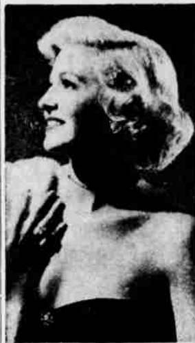
If It Fits —Film Actress Marilyn Maxwell has been chosen as the Diamond blonde by the Diamond Manufacturers and Importers Association of America.