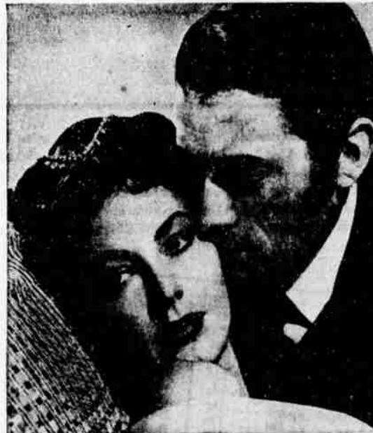
Gregory Peck and Ava Gardner from the new romantic team introduced today on the Capitol screen in "The Great Sinner," drama of a man whose passion for gambling makes him reckless of life and love. Also seen are: Melvyn Douglas, Walter Huston, Ethel Barrymore, Frank Morgan and Agnes Moorehead.