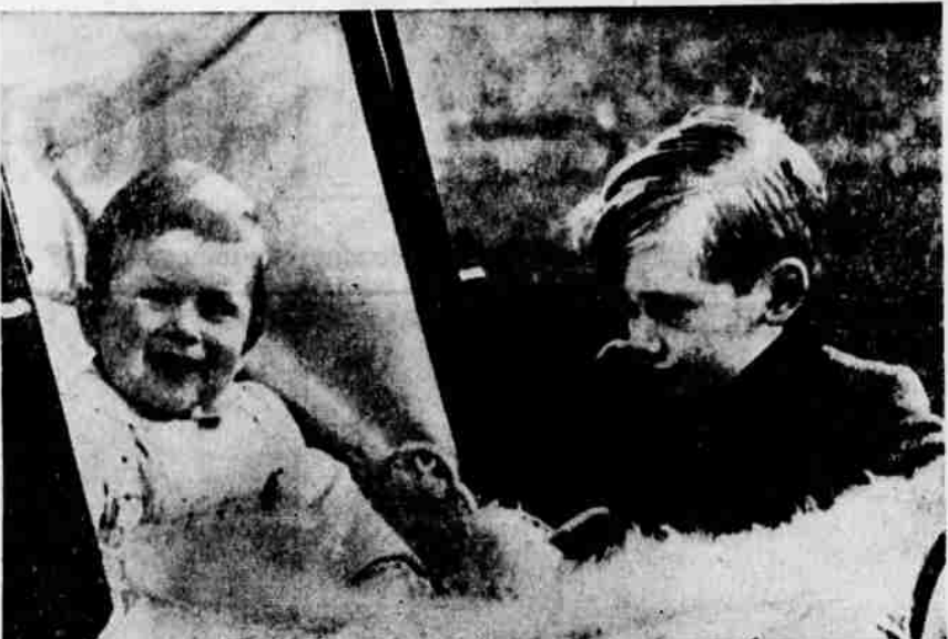
Prince Elizabeth's Baby Son, Prince Charles, who celebrates his first birthday Nov. 14, receives a call from his cousin, Prince Richard (right), son of the Duke and Duchess of Gloucester, during an outing in a London park.