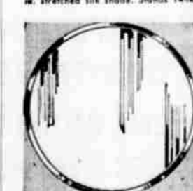
Smart New Mirror Attractive 3/8-in. Beveled Edge Economy Value . . . 4.95 Beautifully polished Venetian plate glass with sturdy composition back. Choose 24-in. circle or square at Sears