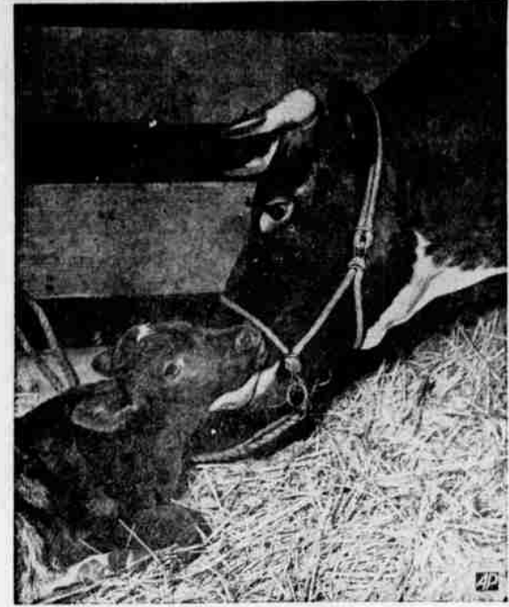
Junior Gets a Licking —Mildred, the cow, gives her two-day-old bull calf a "facial" at San Francisco's Grand National Exposition. They're owned by Twin Valley Farm, of Healdsburg, Calif., property of screen actor Fred MacMurray.