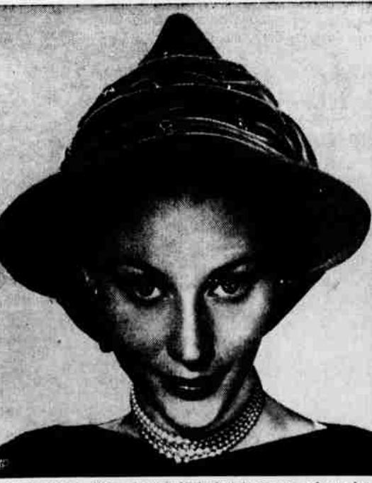
Coolie Note —This piquant little hat in taupe velours has a peaked draped crown trimmed in fake diamond teardrops. Designed by Peter Bondi.