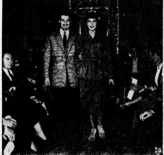
Paris Fashions for Men—A model displays a brown and yellow checked jacket with dark brown flannel trousers, while his companion wears a corduroy ensemble at an exhibition of men's fashions, one of the first of its kind in Paris.