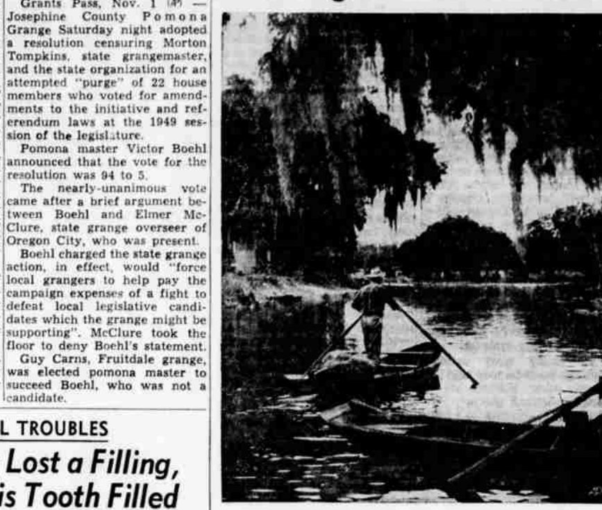
HARVEST-Workers start out to gather Spanish Moss

Baton Rouge, La. — Louisiana's Spanish Moss crop may treble 70 miles from his station. Guided by a Chinese boy who said he knew the way, the missionary says: