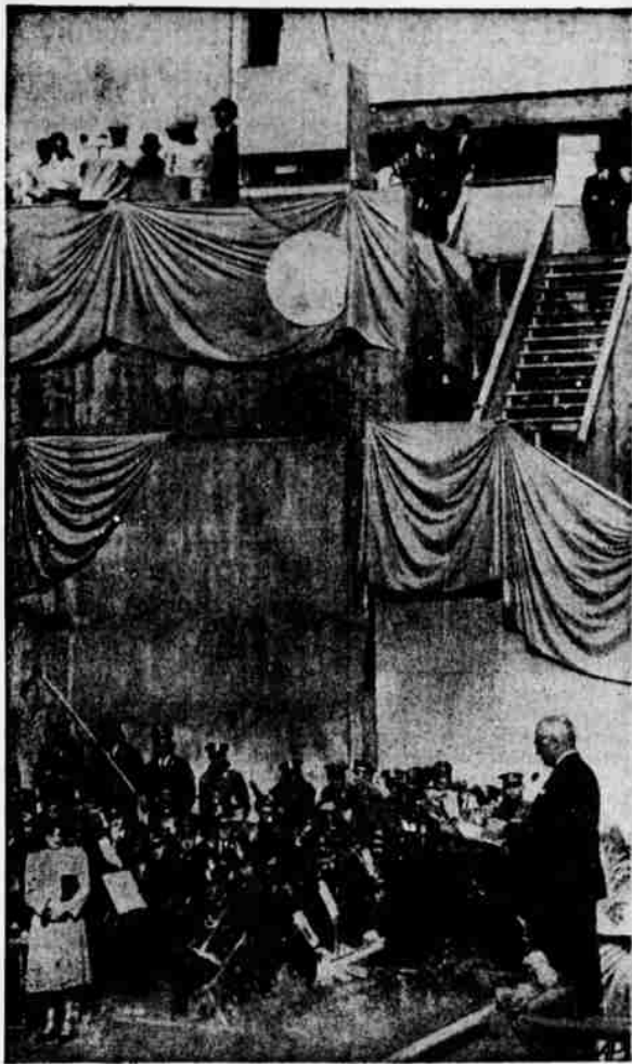
Speaks at Ceremony —President Truman (right) delivers foreign policy speech at cornerstone laying ceremony for United Nations permanent headquarters at New York. High above musicians is the cornerstone which was lowered into place over receptacle containing a copy of the U. N. charter and the U. N. declaration of human rights.