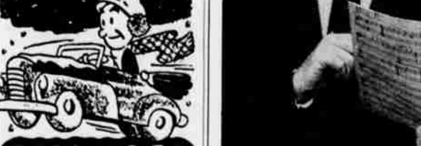
Of the original broadcast stations, WWJ of Detroit and KDKA of Pittsburgh both are still on the air. They started in 1920.