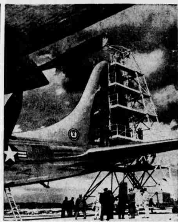
Massive —While the armed forces rake the effectiveness of the B-36 across the coals, pro and con, a B-36 tail section maintenance rig is placed in operation at March Air Force Base, Calif. The huge platform permits ground crews to work all around the bomber's massive tail after it is once placed in position.