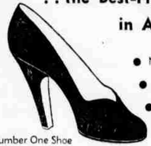
Number One Shoe Fashion of the Year!