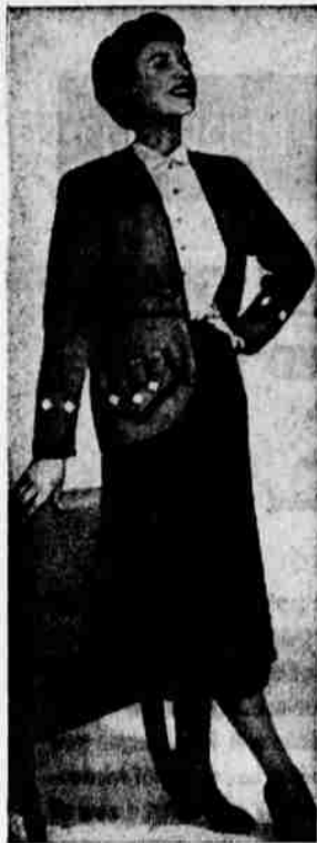
Nifty Knit —Unusual cardigan suit with ribbed skirt in tweedy yarn, red jacket piped in black croch.