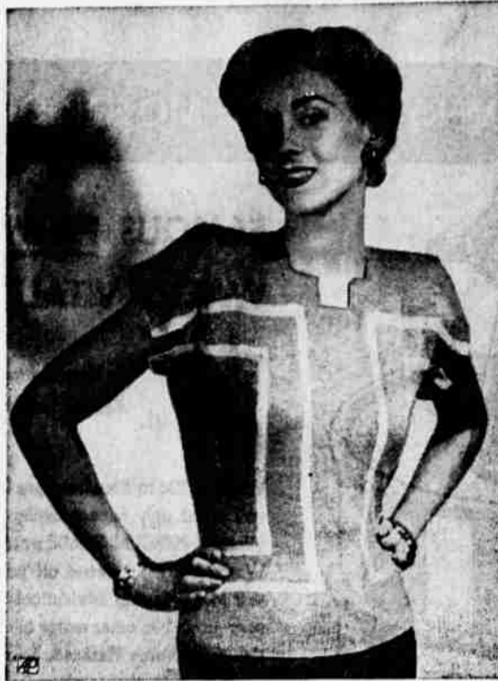
Custom Look —Simple to make but highly styled is this slip-on sweater with notched square neckline and cap sleeves. It is designed by Audrea of Hollywood in pearl gray with geometric pattern in yellow and white.

For free instructions send stamped, self-addressed envelope to National Needlecraft Bureau, 385 Fifth Avenue, New York.