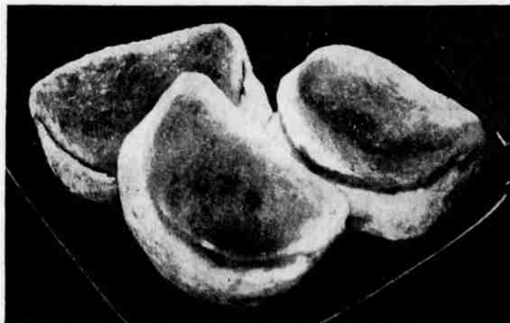
POTATO PARKER HOUSE ROLLS

It's the mix'n' and fix'n' the trick's in! "Saucepan Yeast Rolls" are made without waste motion... without a lot of utensils... and without the "first rising time" of old fashioned recipes! This streamlined, modern method is so easy and quick... so trouble-free... so sure! Yes, SURE, because Sperry guarantees this baking method cannot fail! When you follow this Martha Meade "Saucepan Yeast Roll" Method and use Sperry Drifted Snow "Home-Perfected" Enriched Flour, you'll have perfect bakings the first... and every time... or the Sperry Millers will refund double the amount you paid for your sack of Drifted Snow! No wonder "Women Who Know, Use Drifted Snow"—the all-purpose flour for all their bakings.