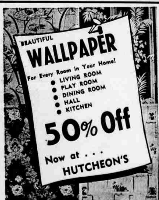
WE GIVE SAH GREEN STAMPS"