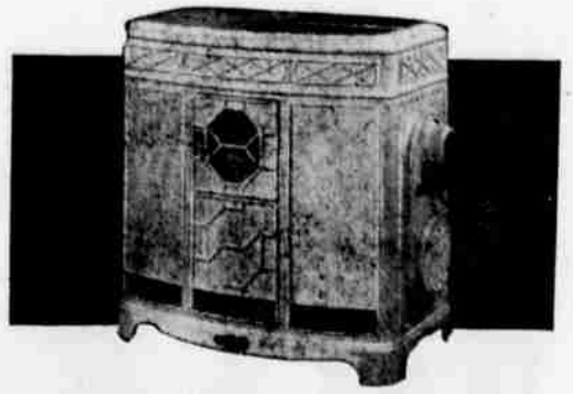
The modern, blonde Duo-Therm Chippendale—see this and other Duo-Therm's for every heating need now at this store! Easy terms? Sure!

MORE COMFORT! Because Duo-Therm gives you just right heat at the turn of a dial. No more hauling coal or wood or ashes. You strike a match—light your Duo-Therm, then enjoy king-size heating comfort all winter. Without work! Without diet!