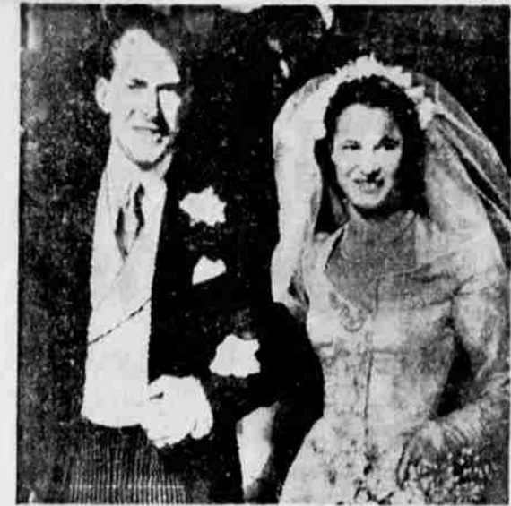
Wed—The Earl of Harewood, millionaire nephew of King George VI and 11th in succession to the British throne, leaves fashionable St. Mark's church in London with his bride, the former Marion Stein, 22, an Austrian refugee pianist.

The Russian books in the U.S. Library of Congress outnumber those in any other library outside Russia.