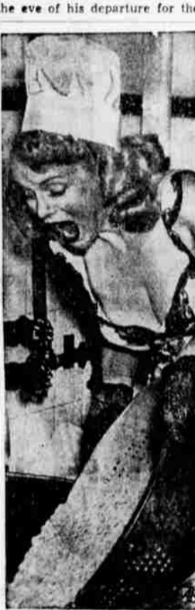
O-o-oh—Actress Marie Wilson, not precisely dressed for the occasion, empties beans into a kettle at the senate restaurant kitchen in the nation's capital, getting some first hand information on preparation of the senators' menu standby, bean soup. On this pose, the scream was real. Marie lost her balance and almost fell in with the beans.