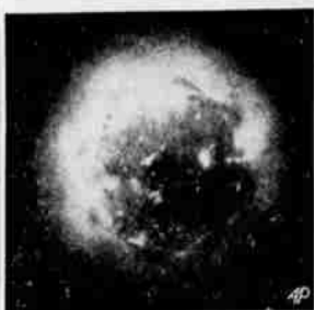
RADIO ACTIVE diamond takes picture of itself in test at University of Michigan.