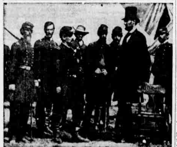
HISTORY IS WRITTEN—This picture of Lincoln and his generals, long credited to Mathew Brady, is now credited to Alexander Gardner.