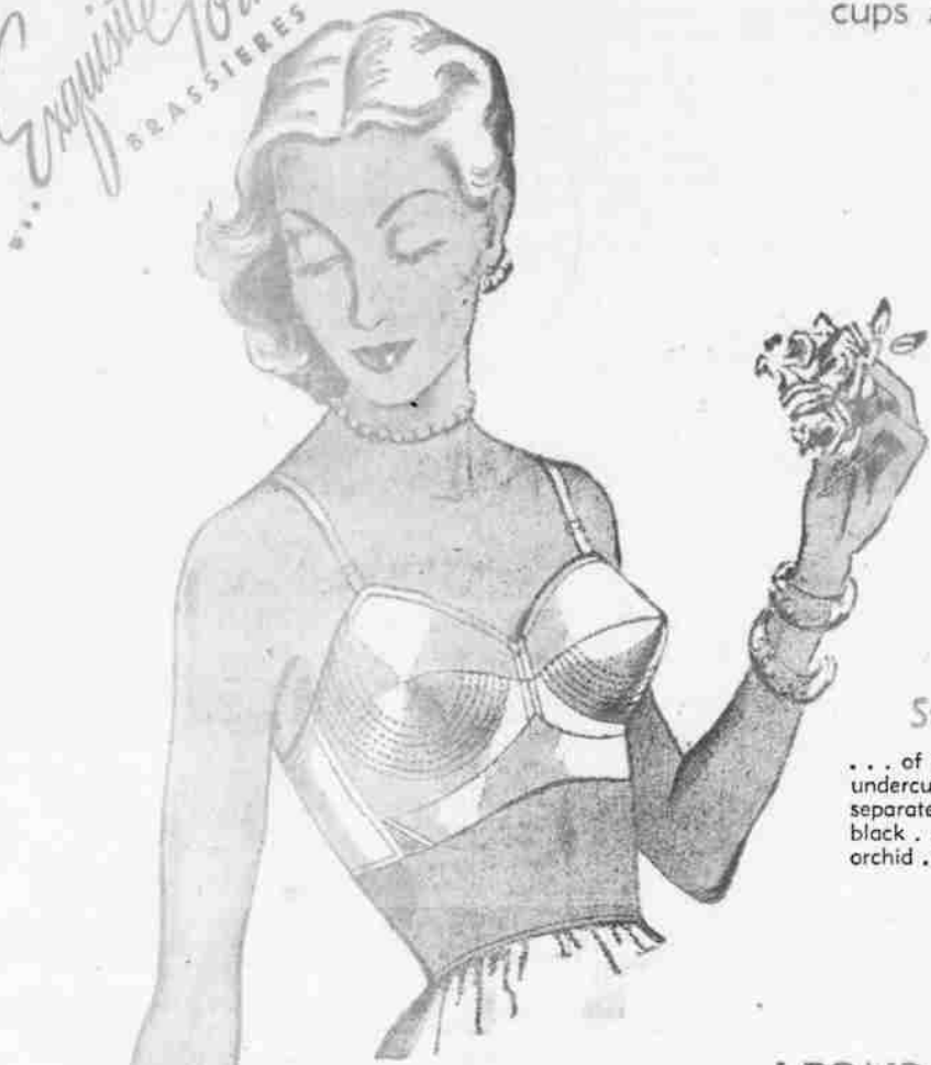
Style No. 505...