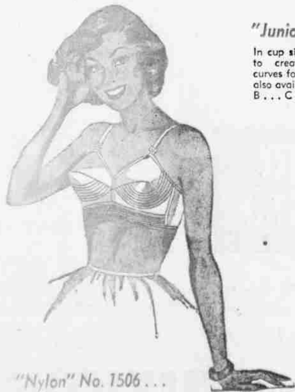
"Nylon" No. 1506...