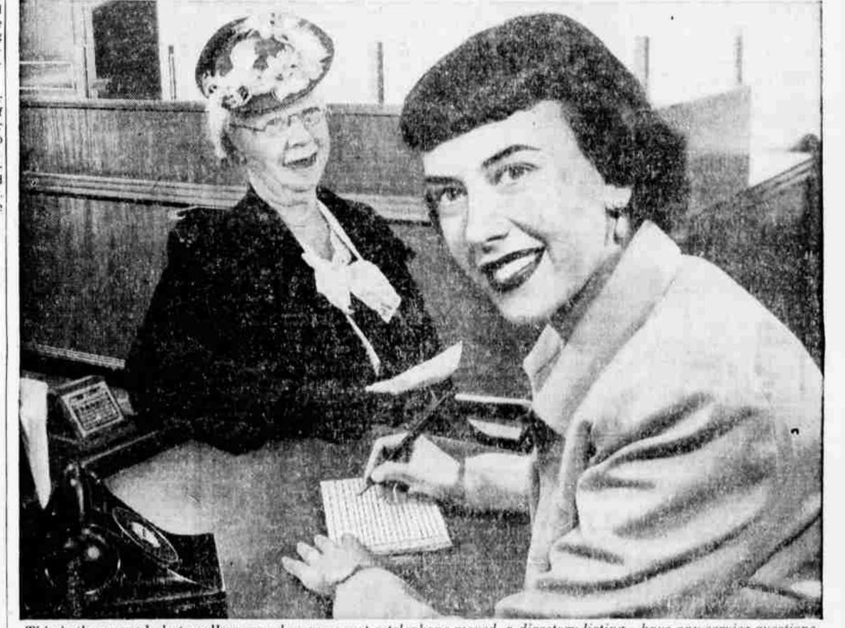
This is the young lady to call or when you want a telephone moved, a directory listing—have any service questions.