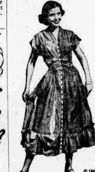
MISS RAGS TO RICHES 1949

With fall rains expected soon, it is "now or never" for slashing fires to get the woods rid of brush that would be hazardous in coming dry seasons.