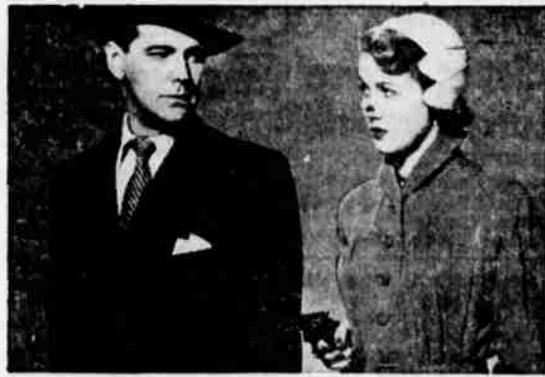
Warren Douglas gets a warning from Audrey Long at gunpoint, in this scene from Republic's "Post Office Investigator," at the State tomorrow with "Brimstone."