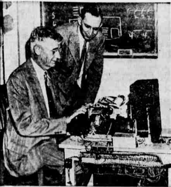
Time Saver —Dr. Vannevar Bush (seated) and Dr. Samuel Caldwell of the Massachusetts Institute of Technology in Cambridge, demonstrates an automatic typewriter that photographs lines of type on film—which in turn can be used to make a printing plate. The whole process takes only five minutes and is expected to revolutionize the printing industry. The device is three times faster than the conventional typesetting machine.