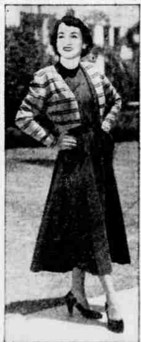
Three to Make Ready for Fall . . . Sir James of California gives you a solid-toned wool-jersey blouse and flared skirt and over it, places a vividly striped cardigan.