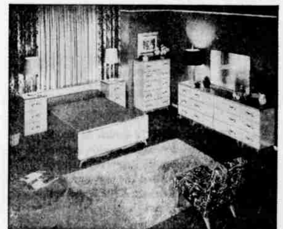
Very New and Smart is the combination of light and dark woods used for this attractive modern bedroom furniture. The light colored wood is the new African Korina, which closely resembles mahogany, while the darker trim is gray mist walnut. Graceful, silver drawer pulls and curved bases add distinction to this flexible, modestly priced group.

Millinery carries the irregular, head hugging shapes shown in the Spring and Summer collections. The helmet, the deep cloche and the little beret are the basic shapes. Making a strong bid for new popularity is the turban — smart, sophisticated turbans have been shown in lovely metallic cloths and spiced with jeweled or feathered accents. Early predictions forecast that the turban will be the fashion for the soft, smooth detailing of the ready-to-wear creations of the season.