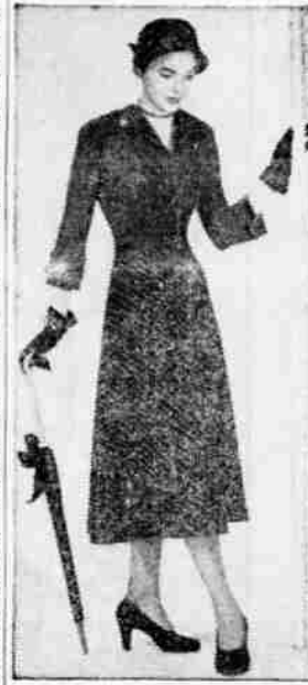
Tweed Stands Out atop the striped skirt of this wonderful all-wool dress! It's by Sigmund Crane, created in deep green, and cuffed in tweed, also.

Fall fashions from California reveal a season of beautiful contradictions — catering to woman's every mood: the demure, the flirtatious or the striking bold manner.