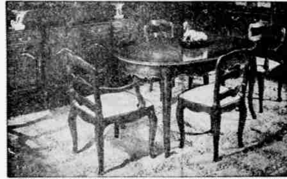
The Graceful Lines, light scaling, and the soft, honey color of this French Provincial dining group combine to make it especially adaptable to the smaller, informal house. Made of walnut, this group is one of the finest reproductions of the French Provincial style which is rapidly gaining popularity.