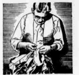
Kuppenheimer sleeve and coat linings are carefully sewn by hand, so they hang properly and stay smooth regardless of hard wear. This assures that armholes fit smartly and comfortably.