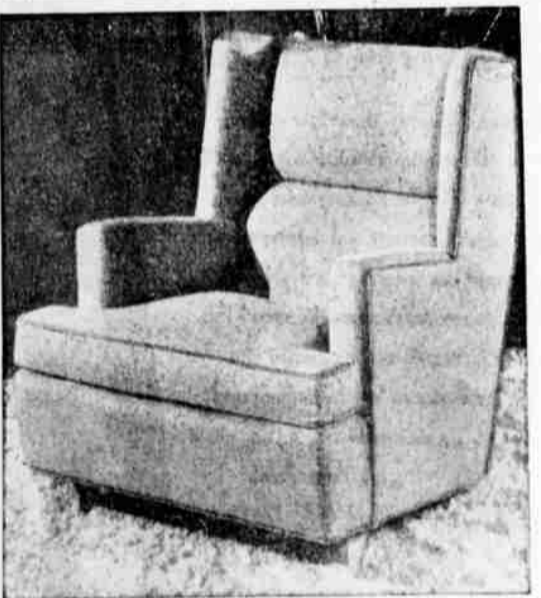
"The Pharaoh"—Futorian's new wing-lounge chair features posture fitting in its modern Egyptian styling. Foam rubber construction in back and seat cushions.