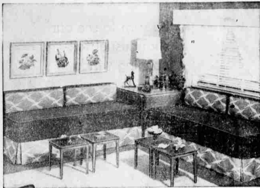
For Apartment-Dwellers, Simmons saves space with modern sofa-beds! Each unit is attached to a single-hinged headboard, has a Deep Sleep innerspring mattress and box spring. Zipper covers and innerspring bolsters are sold separately. Upholstered in plastic covers.