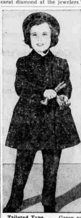
Tailored Type . . . Green co-vert coat with fitted waist, full flared skirt.

Included in the descriptions will be a number of interesting facts known to few outside of the diamond industry. Among is the information that 'it takes twenty-three tons of rock brought out of the dia-mond mine to yield a halfcarat diamond at the jewelers.