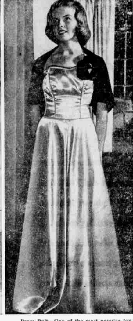
Prom Bait-One of the most popular for-