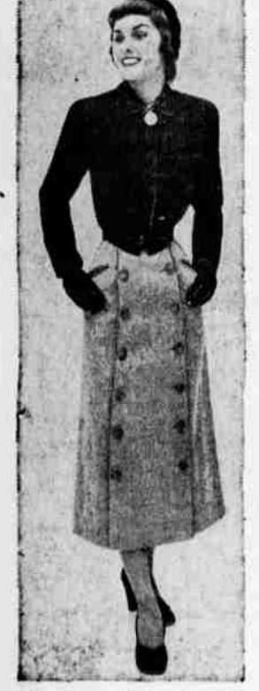
Coordinates! Sporteen places a dark all-wool men's wear jacket over a pale wool flannel skirt. The skirt is twice panelled with dollar-size but-tons, has slashed pockets.

galore — exciting buttons rampant—tucks by the score and all the wonderful detail and the skirt. drapery of the new silhouette gracing your smartly elegant Separates Have "good black dress."