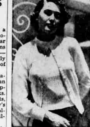
Sweater Set! The most fashionable pair of twins on cam-pus! Gantner's new twin sweater set is specially processed nylon with a sandwich neckline on pullover and car-

Two interesting skirts and one esting casual about-the-campus good jacket equals two suits in wardrobe.