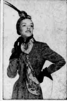
For Something Really Striking, Glentex presents Tweedledee," a silk se scarf tweed print and splashed with vivid autumnal flowers.

On the dressier scene, the or contrasting fabric. bag for evening is cued to the more feminine gowns. Dainty ly shown in the handbag picture