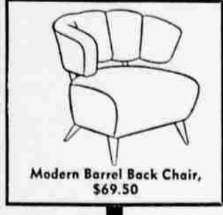
Modern Barrel Back Chair, $69.50