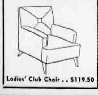
Ladies' Club Chair . . $119.50