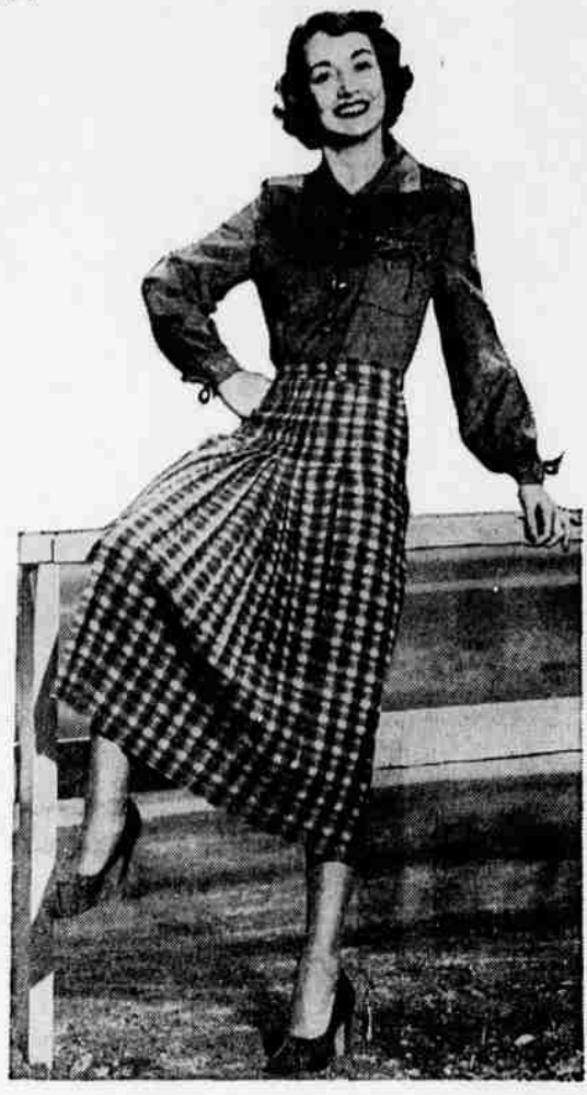
Back-to-School separates return to the rustic in this two-piece ensemble. The shirt is supple corduroy with a hi-or-lo collar line, smart with buttons and bows. The all-wool plaid skirt by Dan Gerstman, has its pleats stitched across the hips for smooth smartness.

Glove Glamour Gloves with a frivolous, feminine look are getting a big hand this fall. Side-draping, smocking, elasticized wrists, multi-stitching and dressmaker detail give new fashion importance to gloves as a major costume accessory.