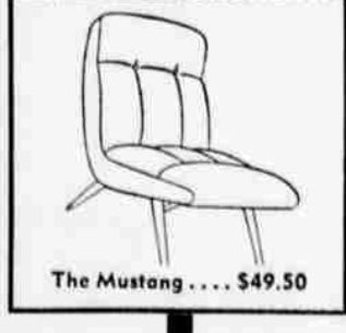
The Mustang . . . $49.50