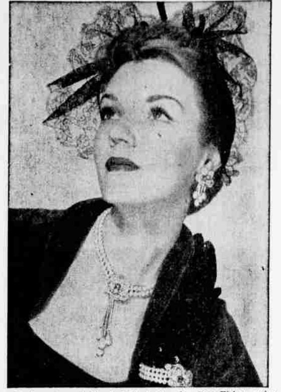
Contour-Carved Black Velvet Cap by Peg Fisher, who adds halo-effect of Chantilly lace. Pearl costume jewelry by Coro.