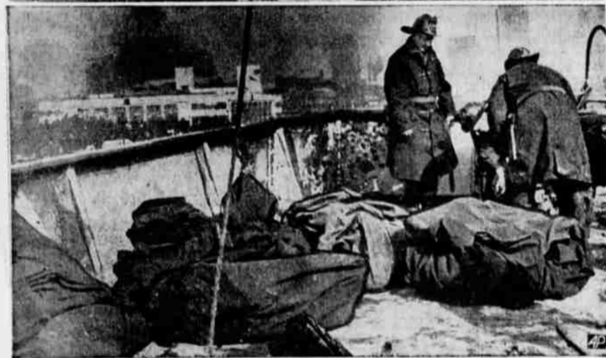
Firemen Gather Bodies—Firemen start the grim task of gathering bodies of victims of the tragic Noronic fire. Bodies wrapped in tarpaulins line the foredeck of the scarred ship, three bodies in each bundle. Many of the bodies have been burned beyond recognition, and a mass burial has been proposed by city officials. The Toronto skyline is seen in the background.