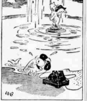
"Hello—I got here as soon as I could. You caught me under the shower." . . . Folks often can't answer your call right away... so please wait a full minute... Pacific Telephone.