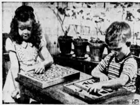
TESTED WHILE PLAYING these youngsters show aptitude.