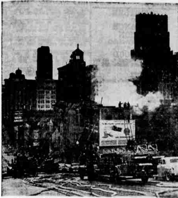
Chinatown Fire —San Francisco's skyline and dawn loom in the background as smoke billows from a three-alarm blaze in the shadow of the city's famous Chinatown. Note Pagoda (left of smoke) and tower of San Francisco-Oakland Bay bridge at the foot of famed California street. The fire caused an estimated $25,000 damage.