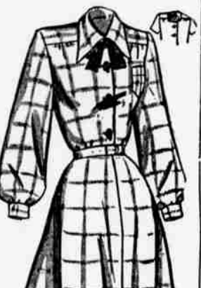
(To Be Continued)

"The car made no effort to stop but, straightening out, tore on into the night."