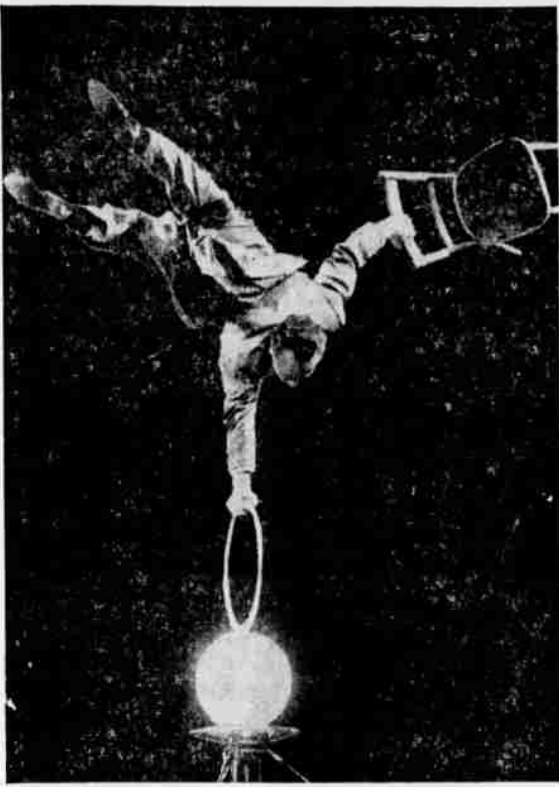
The incredible Unus, sensation of Ringling Bros. and Barnum & Bailey circus, basically gifted, however, with abnormal sense of balance.