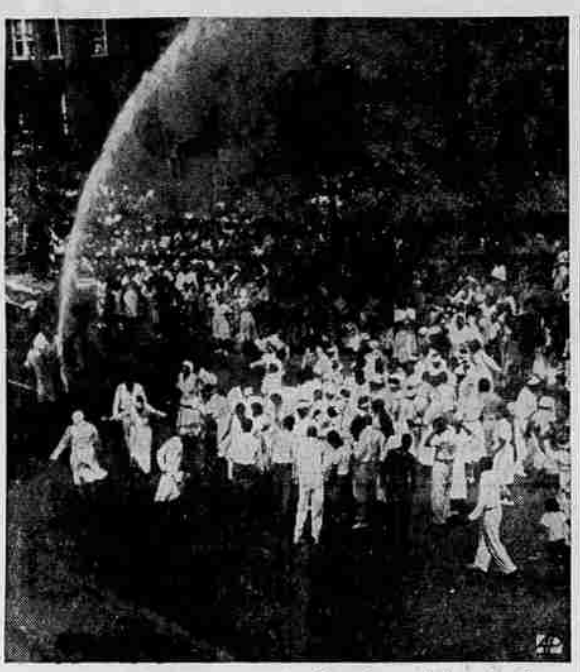
Baptism by Fire Hose-A fire hose is used in a baptism ceremony for followers of Bishop Charles M. (Daddy) Grace Negro evangelist, outside his House of Prayer, Washington

Artists — Photographers 420 Oregon Building - Salen or Phone 3-7830