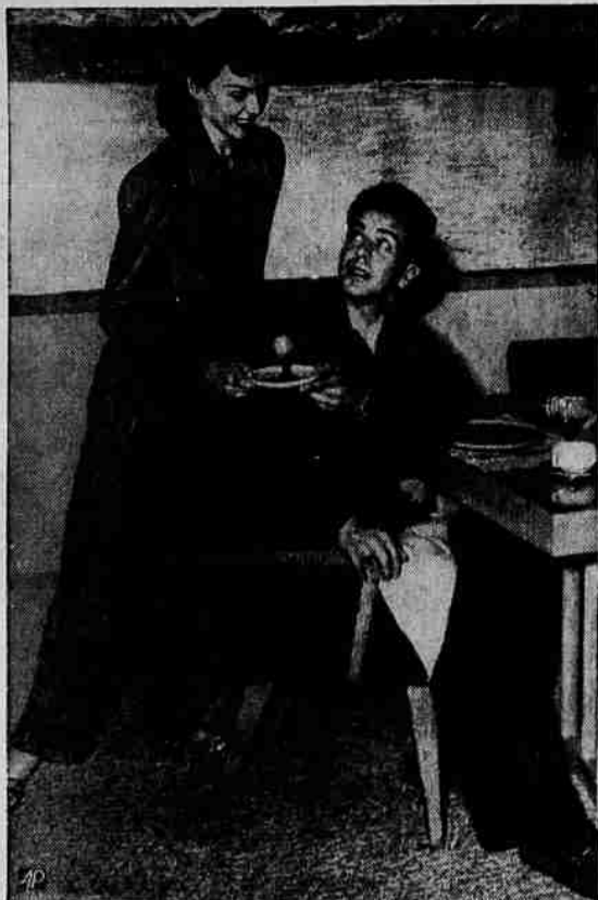
Glamor Overalls —These "one-piece" wardrobes designed by Rosario Castagna of Hollywood can be worn at playtime or on dress-up occasions. Here actress Leslie Brooks serves breakfast to actor Russ Vincent as both wear the new costumes. Priced at less than $30 for women and $35 for men the garments are available in pinroy fabric for women and corduroy for men in red, green, gray.