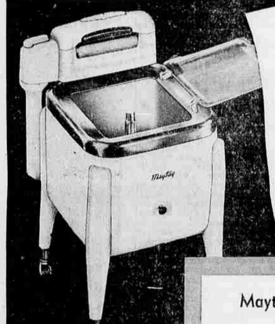
The Maytag Master—finest Maytag ever! Huge, square aluminum tub has extra-large capacity; keeps water hot longer. $189.95