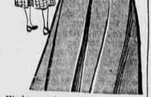
3098 SIZES 10 - 20

Week-end skirt—the newest idea in mix-match sets!