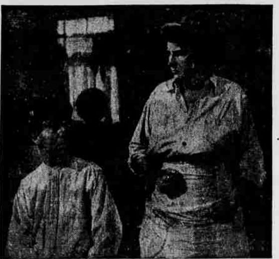
Ma and Pa Kettle—Marjorie Main, who "just missed" the list of "best dressed" women, warns Percy Kilbride to get some new underwear. The lovable comedy team appears in Universal-International's "Ma and Pa' Kettle," repeating the roles they created in "The Egg and I." Now at Warner's Capitol theater.

Window glass in the scout house and also in Queen Anne school, were broken, 50 panes being shattered and the use of a heavy object employed to destroy the wooden frames around the windows.