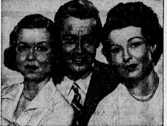
Betty Field, Alan Ladd and Ruth Hussey are co-stars in "The Great Gatsby" with Macdonald Carey, Barry Sullivan and Howard Da Silva. The Paramount picturization of F. Scott Fitzgerald's famous novel is now entertaining audiences at the Elsinore theater. Drama features the dynamic Shelley Winters.