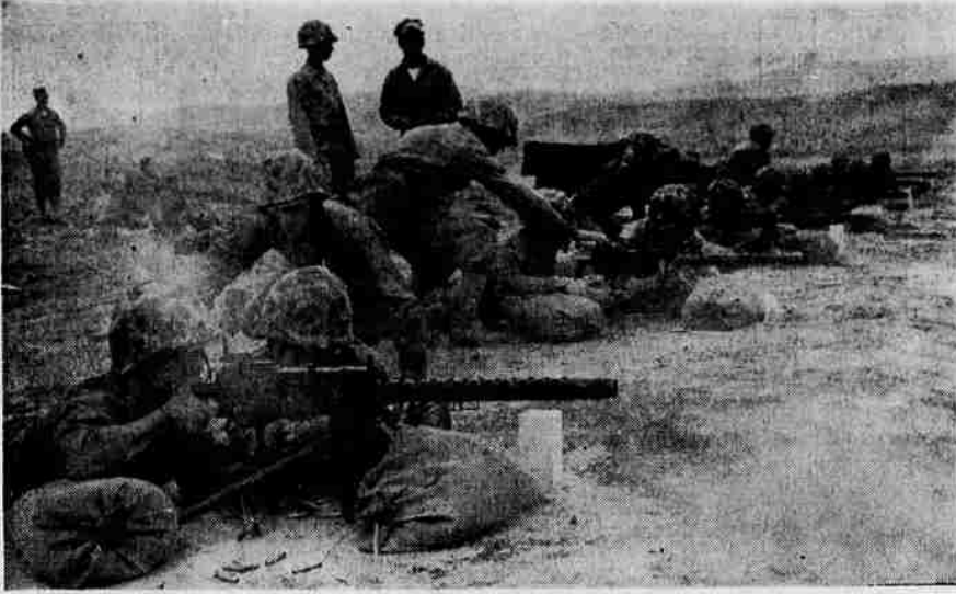
Bullets Split the Air —Marine reservists of the 4th 105mm Howitzer Battalion of Portland, Salem and Eugene, Oregon and the 17th Engineer Company of Portland man light machine guns at firing practice at Camp Joseph H. Pendleton, Ocean-side, Calif., where the civilian-Marines are taking two weeks of active duty training.