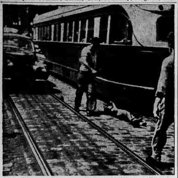
Anxious Moment-Robert Lindahl, 11 lies in a Chicago, seph Chudada, driver of the car, rushes up to aid the injured boy who was treated for head injuries.