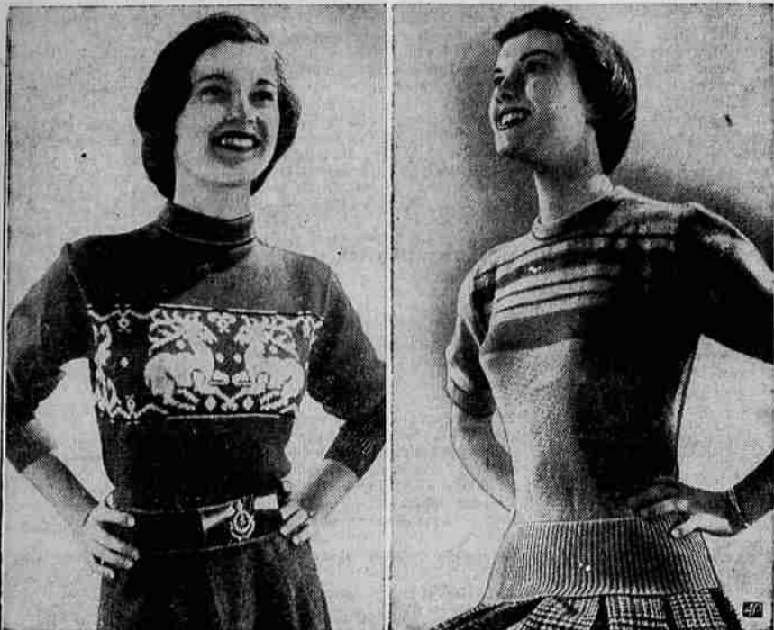
Ski Sweater —This is the favorite for winter sports—bright red jacquard knit with turtle neck and reindeer motif. Athletic type, at right—For class or general campus wear the co-ed likes the lightweight turtle neck sweater with stripes.