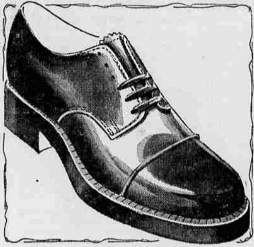
Young Men's Straight Tip Oxfords! Save!

For many months our buyers in New York, Chicago, Dallas and Los Angeles have been busy gathering back-to-school values for your savings! In most instances we have ample quantities to select from, but don't delay too long—come in and see our convenient Lay-Away Plan if you wish. Listed below are but a few of the outstanding money-saving values we have throughout the store! When you shop at Penney's you always save!