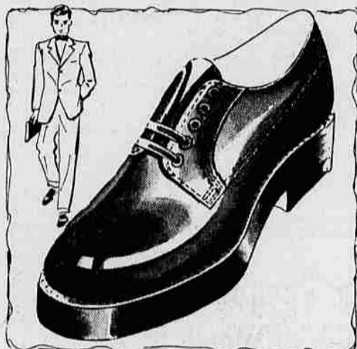
Young Men's Oxfords

The folded tip feature is a brand new idea! See the simple, well-built lines — the smooth side leather . . . the rugged-looking heavy rubber soles! Proof that Penney's brings you up-to-the-minute styles at thrifty prices! 6-12, B, C, D. 8.90