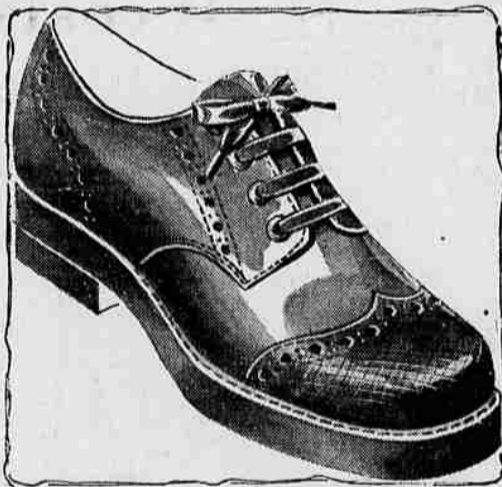
Scuffless Tip Oxfords for Boys

Let him kick and scuff to his heart's delight! This shoe can really take it! Scuffless shield tip oxford with special inter-flex soles (they wear like iron) and comfortable rubber heels. Smooth, carefully selected leather uppers. Brown. 12½-3. 8½-12 4.49 3.98