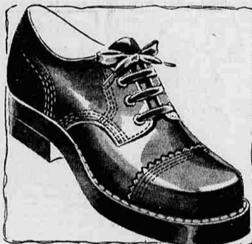
Bold Look Oxfords for Young Boys

Let him kick and scuff to his heart's delight! This shoe can really take it! Scuffless shield tip oxford with special inter-flex soles (they wear like iron) and comfortable rubber heels. Smooth, carefully selected leather uppers. Brown. 12½-3. 8½-12 4.49 3.98