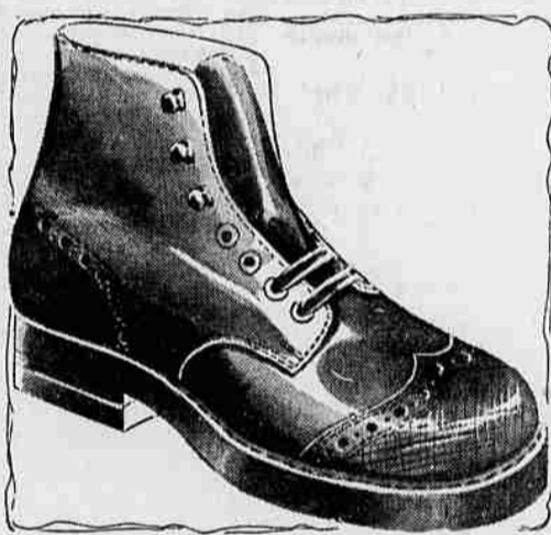
Boys' Scuffless Tip High Shoes

Come in and feel that heavy rubber sole! Bend it! See how flexible it is! See the heavy harness stitching on the uppers . . . stroke the sturdy leather—poke around the insides! Here's real value! Burgundy. 12½-3. 3.98