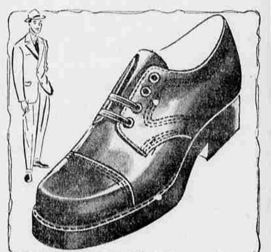
Young Men's Smart School Oxfords

If you're in the market for a shoe with plenty of handsome styling —this is it! Smart moccasin oxfords with the new ghillie tie PLUS red rubber soles and heels for wear, comfort, and style. Smooth side leather. Cherrytone. 7-11 B, 6-11 C, D. 7.90