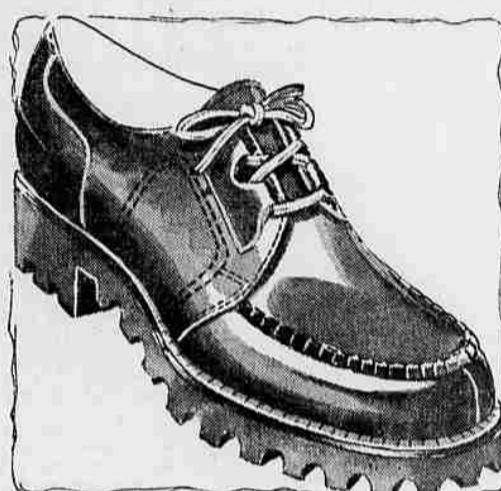
Young Men's Ghillie Tie Oxfords! Save!

Just measure those soles! One inch t-h-i-c-k! And wait till you see these solid leather heels! You'd expect to pay much more for shoes like this! Extra special Goodyear Welt construction for long, long wear! That's value for you! Burgundy. 6-11, B, D. 13.75