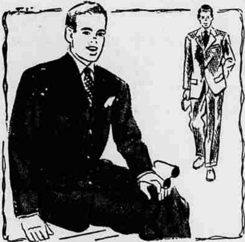
BOYS' ALL WOOL TWEED SUITS

For many months our buyers in New York, Chicago, Dallas and Los Angeles have been busy gathering back-to-school values for your savings! In most instances we have ample quantities to select from, but don't delay too long — come in and see our convenient Lay-Away Plan if you wish. Listed below are but a few of the outstanding money-saving values we have throughout the store! When you shop at Penney's you always save!