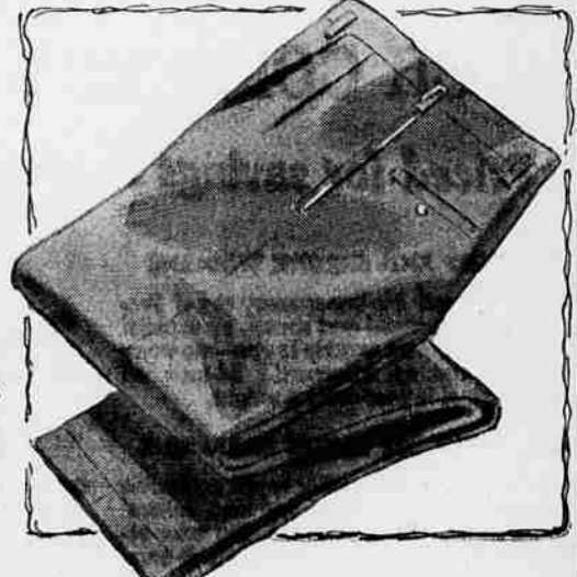
BOYS' BACK-TO-SCHOOL SLACKS

A new luxury gabardine made of 2-ply yarn, insuring greater strength and durability. They're made of 77% rayon and 23% wool , styled the way boys like them. Continuous waistband, double pleats, dropped belt loops, saddle stitched or plain seams. Solid colors, 8 to 16.