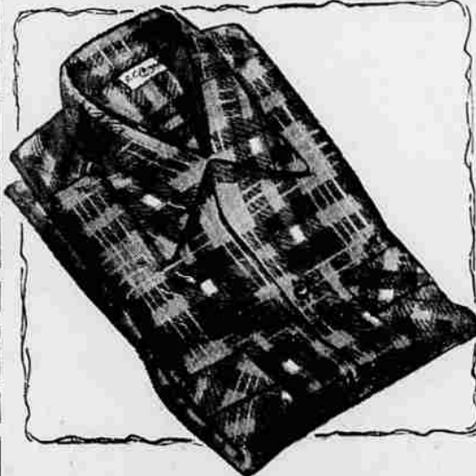
'JIM PENNEY COTTON FLANNEL SHIRTS

Imagine! Sanforized* woven-through cotton flannel plaid sport shirts for only 1.79 ! They're laboratory tested for extra long wear, and they're easy to launder. Two flap pockets, smart sport collar. Wear them in or out of trousers. Brilliant new plaids. 6 to 18.