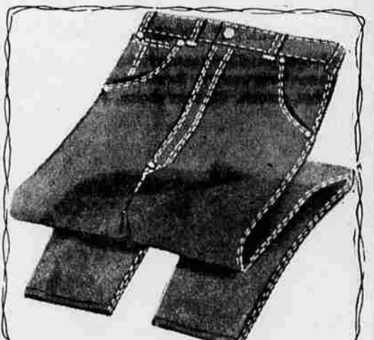
NEW IMPROVED BOYS' WESTERN JEANS

Now, Penney's famous 11-oz. saddle jeans boast a new zipper fly . . . smooth and washable. Look for the heavy orange stitching, complete reinforcement with copper rivets and bartacks. At Penney's in boys' sizes 4-16.