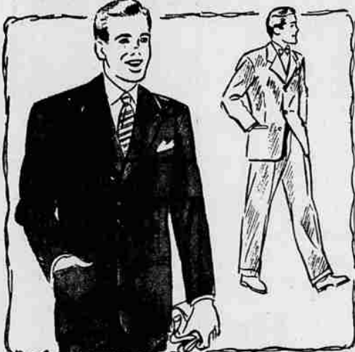
BOYS' DELUXE SUITS FREE-AND-EASY STYLED

Watch him step out with a jaunty stride in this handsome suit! Smooth, crisp-finished 60% rayon, 40% wool gabardine. Blue, brown, tan, single and double breasted. At a sensible cash-and-carry price that saves you plenty. All sizes 10-18.