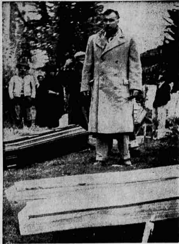
Earthquake Victims Buried —President Galo Plaza Lasso of Ecuador stands among caskets in the cemetery at Ambato during burial services for earthquake victims whose bodies have been recovered from the city's ruins. Ambato, a city of 20,000, was in the center of the 4,000-square-mile area of this small South American country devastated by the quake. An estimated 8000 persons were killed and many thousands were injured.