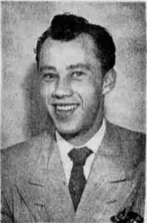
Larry Schmidt Rugs

The Stayton Switchboard association will build a one-story, one-room addition to its present quarters on First street, between Ida and High streets. It will have frame construction and oil heat. The cost was given as $1650. G. W. DeJardin is building a new garage 24x24 feet with cement floor and foundation, and frame construction. It is located at the DeJardin home on High street and will cost $900.