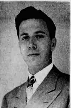
Alldon Sockwell Vacuum Cleaners & Sewing Machines

For a new kind of dessert, put a cup of drained canned fruit cocktail in a container, add a cup of sour cream and two cups of cut marshmallows; mix well, cover, and allow to stand in the refrigerator overnight. Serve chilled in sherbet glasses to six to eight people.