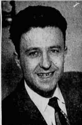
Jack Quesnel Drapery