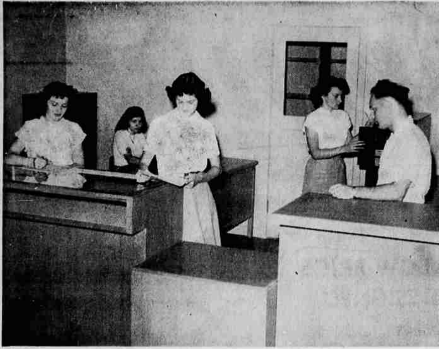
Customers' Service Begins Here—Sears' adequate and efficient staff of trained personnel is available for customer service relating to all trans actions and is always on hand to supply parts for Sears' appliances.