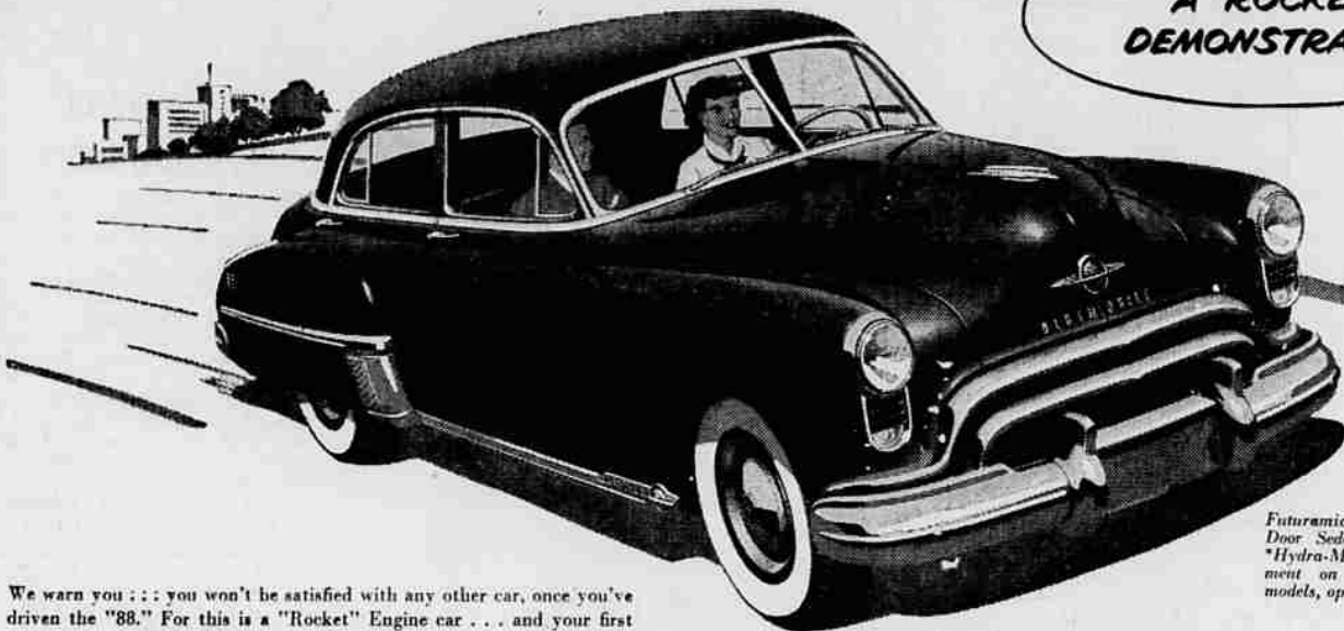
Futuramic Oldsmobile "88" Four-Door Sedan with "Rocket" Engine, "Hydra-Matic" Drive standard equipment on Series "98" and "88" models, optional at extra cost on "76."

We warn you... you won't be satisfied with any other car, once you've driven the "88." For this is a "Rocket" Engine car... and your first minutes at its wheel will give you a completely new point of view about motoring! Here's eager power that makes traffic driving easy. Here's effortless power that's tuned to the open road. Here's true high-compression power that costs less, not more, to command! And it's paired with the new ease and safety of Hydra-Matic Drive. All this plus Futuramic Styling in compact yet spacious Bodies by Fisher! But you've got to drive it to believe it... so make your date with the "88"! Call your Oldsmobile dealer—now!