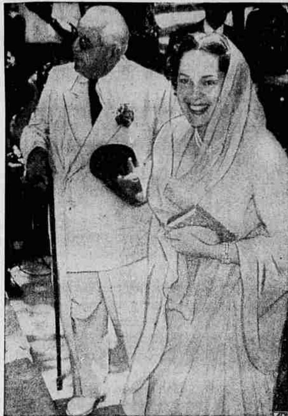
Victims of Bandits —The Aga Khan and his wife, the Begum Khan, (above) were held up by four armed bandits as they left their villa on the French Riviera, the Paris newspaper France Soir, reported. The Aga Khan, one of the world's richest men and father-in-law of Rita Hayworth, and his wife were in a car leaving the estate when the holdup took place. The bandits were reported to have escaped with money and jewels worth $450,000. This photo was made as they arrived for the wedding of Rita and Prince Aly Khan in May.