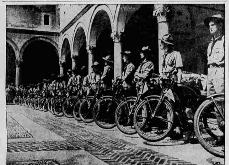
Off on a 2,485-Mile Ride —Italian Boy Scouts line up in Milan at the start of a 2,485-mile motorcycle ride to the International Boy Scout convention in Oslo, Norway.

YOU CAN BE SURE.. IF IT'S Westinghouse Yeater Appliance Co. 255 N. Liberty Phone 3-4311 WATCH FOR THE GRAND OPENING OF OUR NEW STORE!