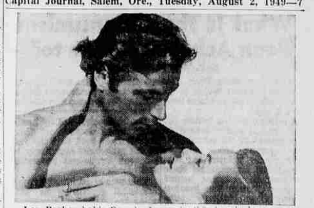
Alex Barker holds Brenda Joyce, in this jungle love scene from RKO's new "Tarzan's Magic Fountain" at the Grand tomorrow, with "Shadow Valley."