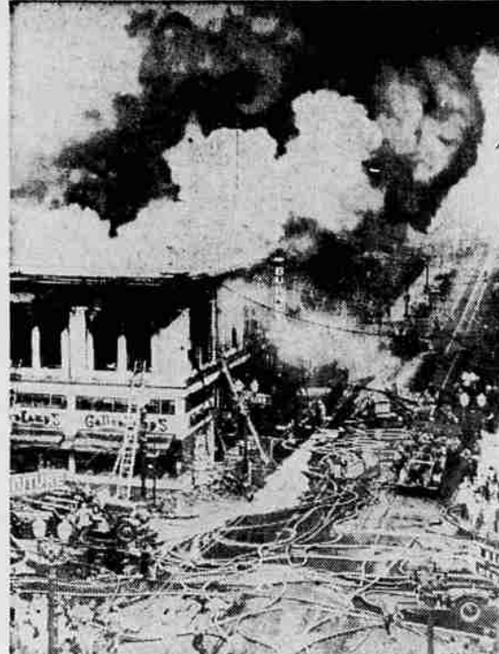
Gambling Club Damaged by Fire —A three-alarm fire gutted the second story Sportsman's club in Portland, Ore., causing heavy damage to eight shops in the two-story brick building. Damage was estimated at $100,000.