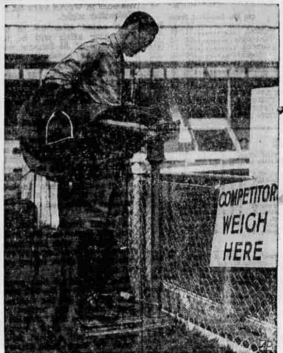
Boots and Saddle Prince Bernhard, consort of Queen Juliana of Holland, weighs in before riding in one of the events of the International Horse show at White City, London.

Medford has in the past dumped much of its sewage into Bear creek, which is a tributary of the Rogue river. Central Point also uses this method of disposal