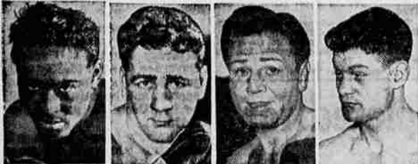
Ezzard Charles Gus Lesnevich Lee Savold Bruce Woodcock

The big attraction, of course, is the heavyweight battle between Charles and Gus Lesnevich in Yankee Stadium on Aug. 10, even though New York's boxing commission remains firm in refusing to recognize the winner as champion.