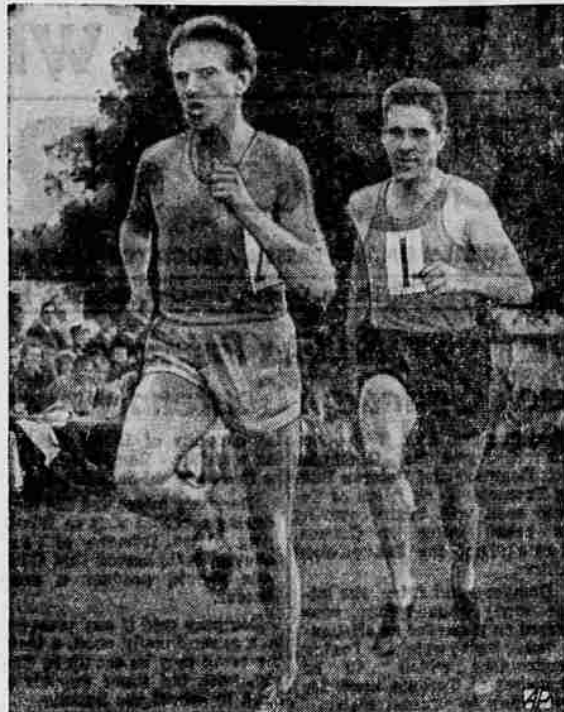
Teacher Leads Parson Gil Dodds (right), America's "flying parson," visiting Scandinavia on a six-weeks preaching tour, is beaten by Arne Andersson, Sweden's "flying school teacher," in an exhibition 1000-meter race at Stockholm.

"Well, you have years when you break even," he says rather proudly.